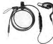
C-Style 3.5mm Wired Earpiece