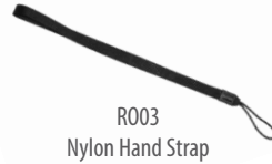
R003 Nylon Hand Strap